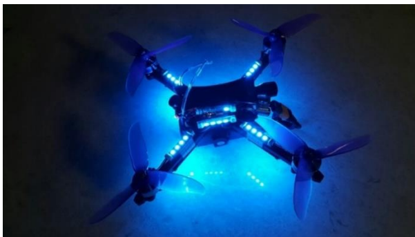
Ref. 2 Sample of LED Light