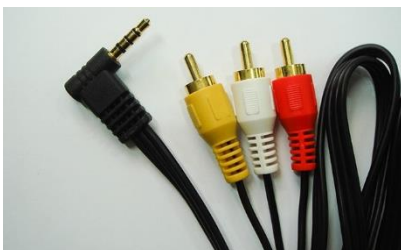
Ref. 1 Sample of receiver cable